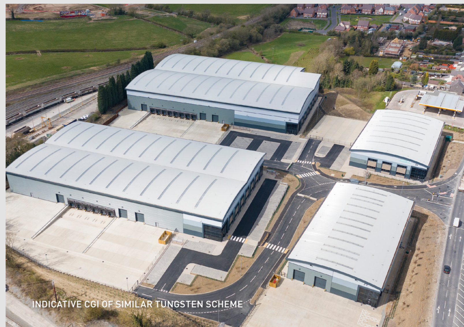
INDICATIVE CGI OF SIMILAR TUNGSTEN SCHEME

COMPANIES AT THE NEARBY BUSINESS SITE CONSIST OF RH COMMERCIAL VEHICLES, NORTHGATE VEHICLE HIRE, GIANT UK LTD AND MAGMA CHARTERED ACCOUNTANTS